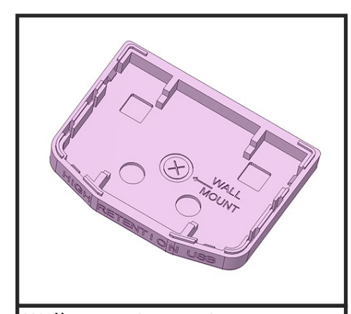
Wall mounting option