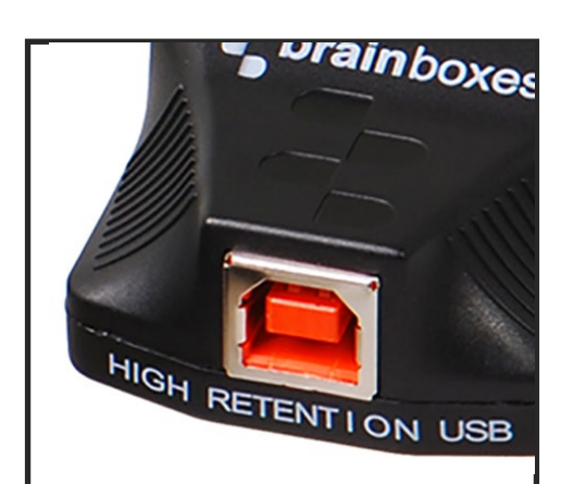
High retention USB connection requires a minimum withdrawal requirement of 15N (thats a force of 1.5Kg or 3.4lbs)