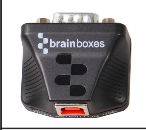
IP-50 rated non-conducting case