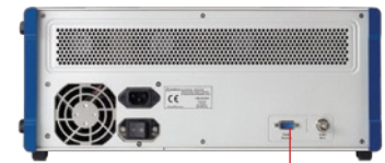
Remote Monitoring Port

The PXIS-2719 has a built-in control board that monitors and manages chassis status, including internal temperature, fan speed, and voltages. Using the RS-232 monitoring port, the chassis status information can be exported to another computer for remote management. The control board can also accept commands from the remote system to allow remote power on/off and fan speed control of the PXIS-2719 chassis.