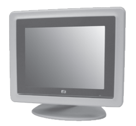
▲ Deskton stand