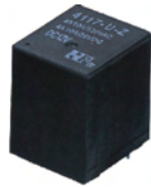
Open Type 13.2×15.3×18