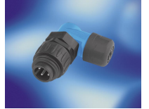
View represents all available contact positions.