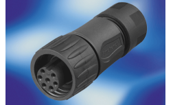
View represents all available contact positions.