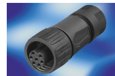
View represents all available contact positions.