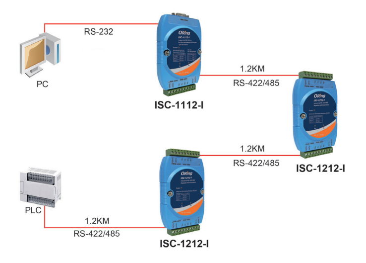
Connections of RS-422/485 Repeater

The ISC-1212-I is a RS-422/485 repeater which boosts the RS-422/485 signals to extend the reach distance up to 4000 ft (1200m) and increase the maximum number of connection up to 128 nodes. With a special circuitry, ISC-1212-I is able to automatically detect the data flow and switch the direction of the data lines accordingly. "Auto baud rate detector" enables ISC-1212-I to automatically configure RS-422/485 signals to any baud rate without external switch setting. Build in opto-isolations on ISC-1212-I provides 3000VDC of isolation to protect the host computer from destructive voltage spikes on the RS-422/485 data lines. ISC-1212-I also offers internal surge-protection on the data lines. The internal high-speed transient suppressors on each data line protect the module from dangerous voltages levels or spikes. Therefore, the ISC-1212-I is a reliable RS-422/485 repeater and can satisfy most demand of operating environment.